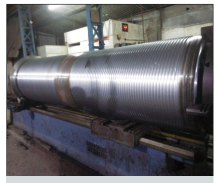
CONVENTIAL TURNING 5 METERS